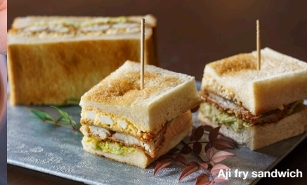
Aji fry sandwich