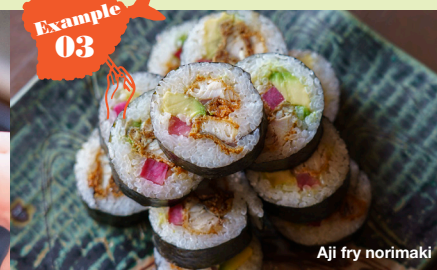
Aji fry norimaki