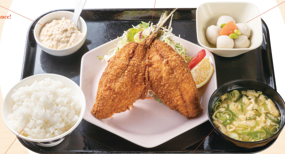
Note: Photos shown are for illustrative purposes only.

Compared to tonkatsu (pork cutlet) and hamburger steak, where the taste explodes with the first bite, aji fry brings a feeling of happiness as its flavors slowly unfold in your mouth. Your heart will flutter when you hear that aji fry is on the menu tonight. That's the true potential of aji fry.