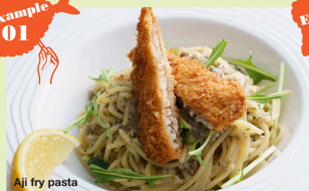
Aji fry pasta