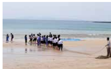
② Beach seine fishing