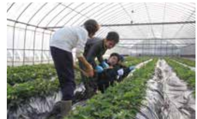
① Nurturing strawberries