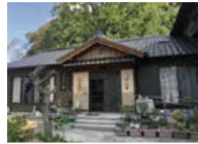
〈Views of home life〉

People from travel agencies and school personnel stay separately at nearby hotels. Prior consultation is required for those wishing to inspect the homes providing accommodation.